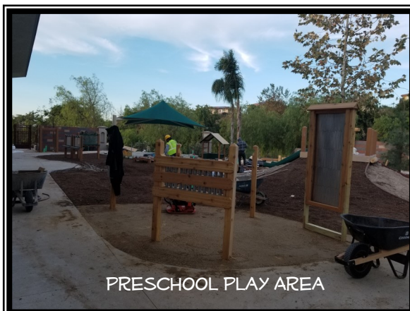
PRESCHOOL PLAY AREA