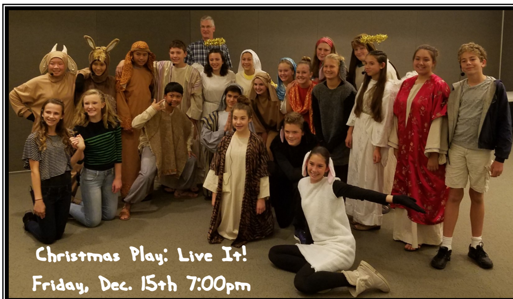
Christmas Play: Live It! Friday, Dec. 15th 7:00pm