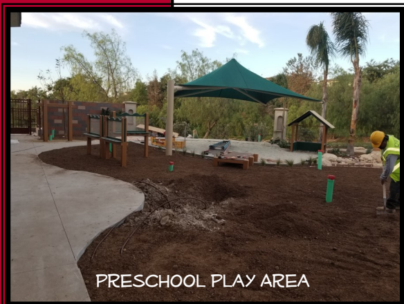
PRESCHOOL PLAY AREA