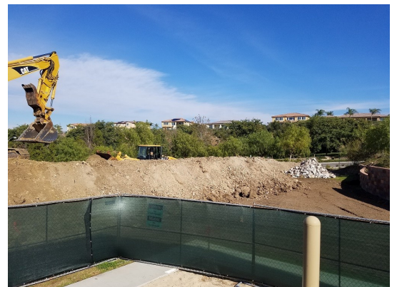
St. Gregory the Great Catholic School