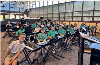
Our 5 th graders showcase our renowned musical center

Contact us at office@stggcs.org or 858-397-1290.