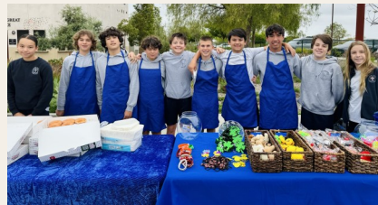
Donut and keychain fundraiser event for Rady's Children's Hospital