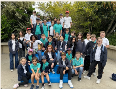
5 th Graders learn about ecology at the zoo