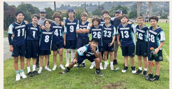
Our Varsity Football and Volleyball teams are champions!