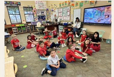
1 st Graders show love for their school!