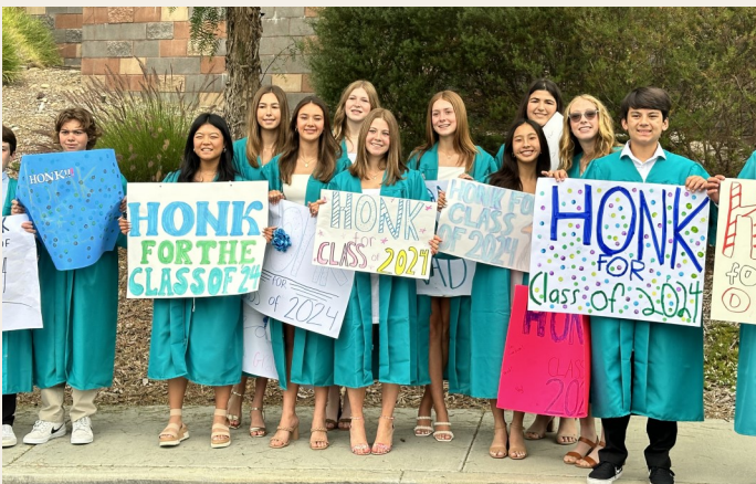
Honk for the Class of 2024!

Congratulations to all our 8th graders who were accepted into their chosen Catholic High Schools. Three received awards and scholarships from their accepting schools. We are so excited to see where God will take them next.