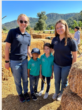
8 th Graders and their Kindergarten buddies adventure to Bates Nut Farm together.